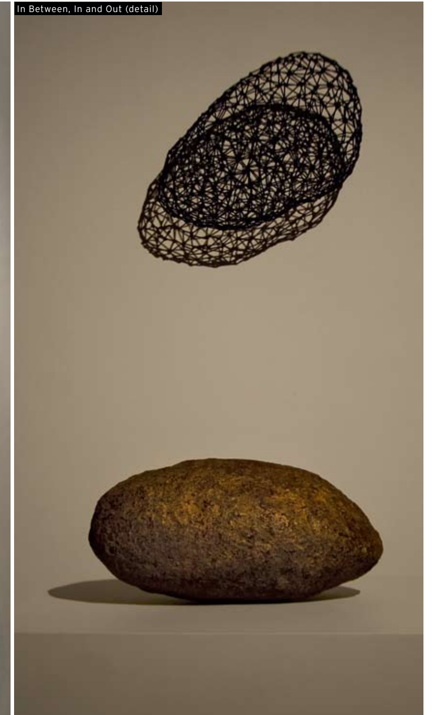
In Between, In and Out (detail)